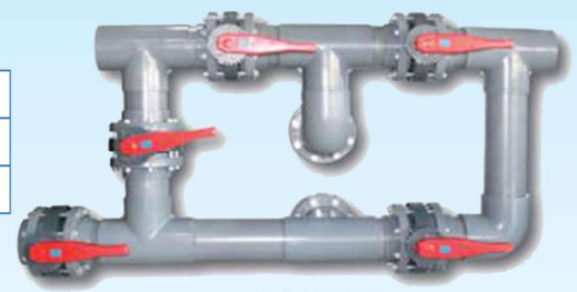
5 way butterfly valve